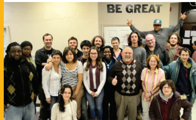
Above: participants of our "We've Got the Power" Training.

Stone Soup Community Center - we are members of this collective building and community center with a movement-building mission. www.StoneSoupWorcester.org